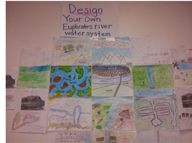
Student work is always displayed in each teacher's classroom.