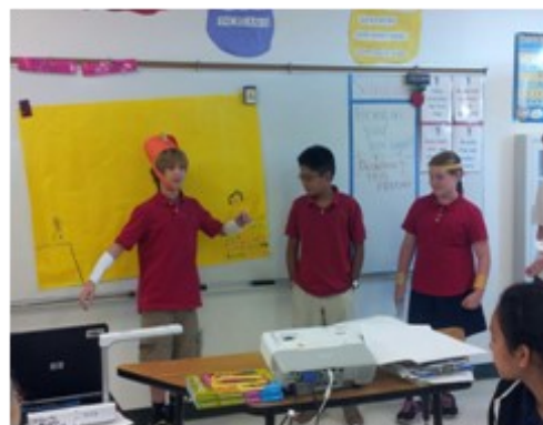
Government officials come to life in a dramatization of daily life in Ancient Egypt.

We hope that you've enjoyed this tour of the 6th grade Ancient World History classroom. We look forward to having you on our official journey next school year!