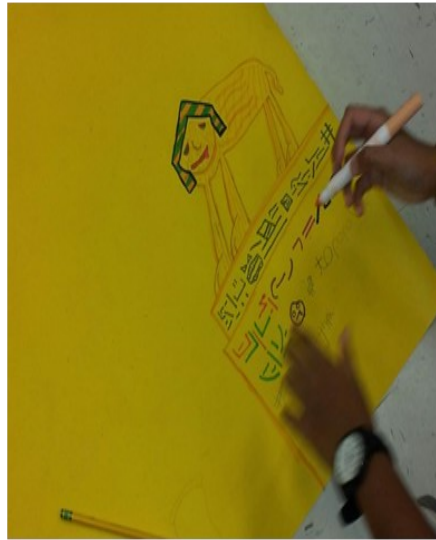
Students design their stage for Ancient Egypt performance.